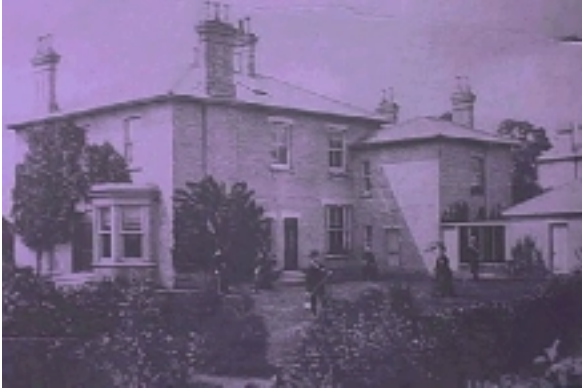
57a London Road (circa 1900)