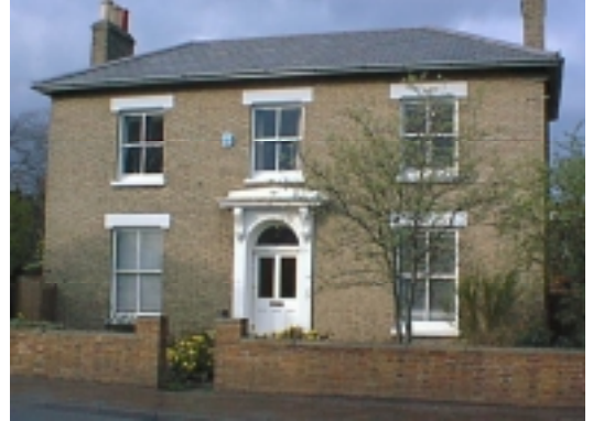
59 London Road